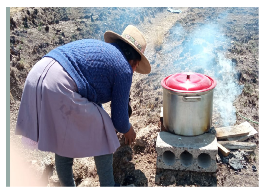
Photo: Planting seed potatoes in the province of Espinar. Credit: Elsa Merma Ccahua