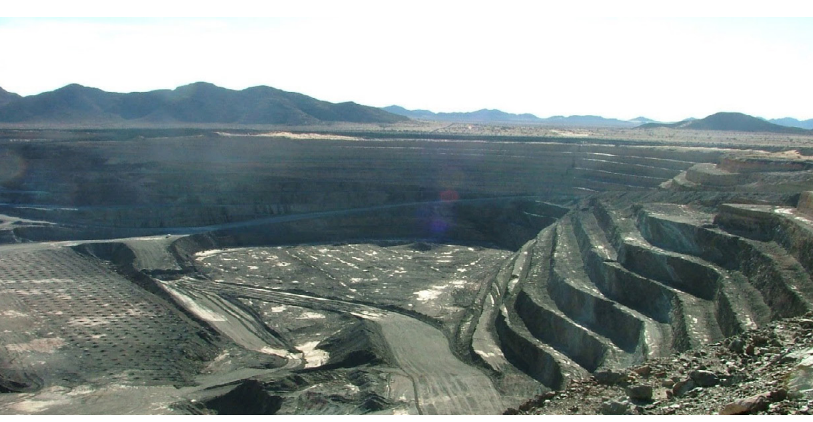
Photo: The Soledad-Dipolos Mine, owned by the Mexican company Fresnillo plc on the territory of the ejido El Bajío, Sonora, Mexico.