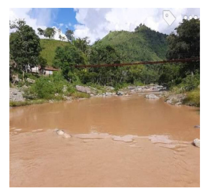
Photos: Contamination of the Rio San Pedro, before and after.