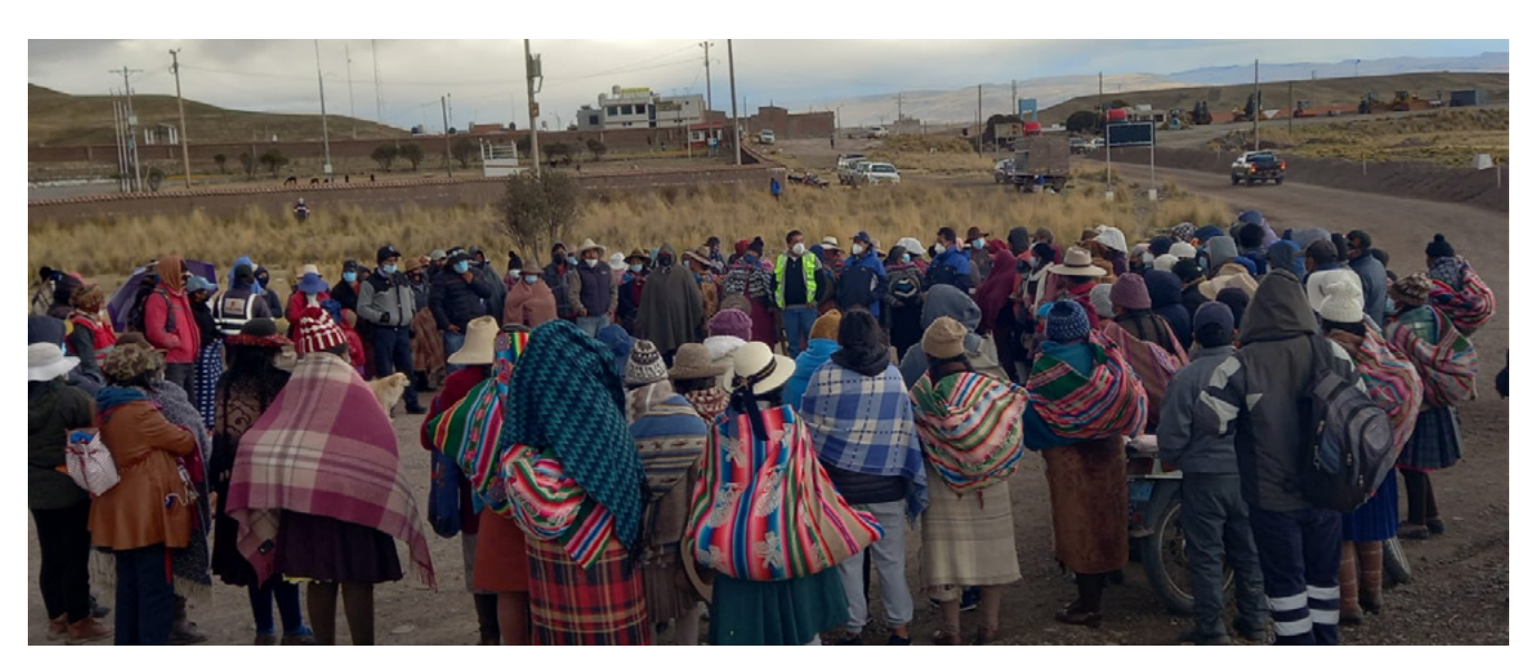
Photo: Protest of 11 communities affected by the irregularities in the consultation for the expansion of Antapaccay, through the Coroccohuayco project.