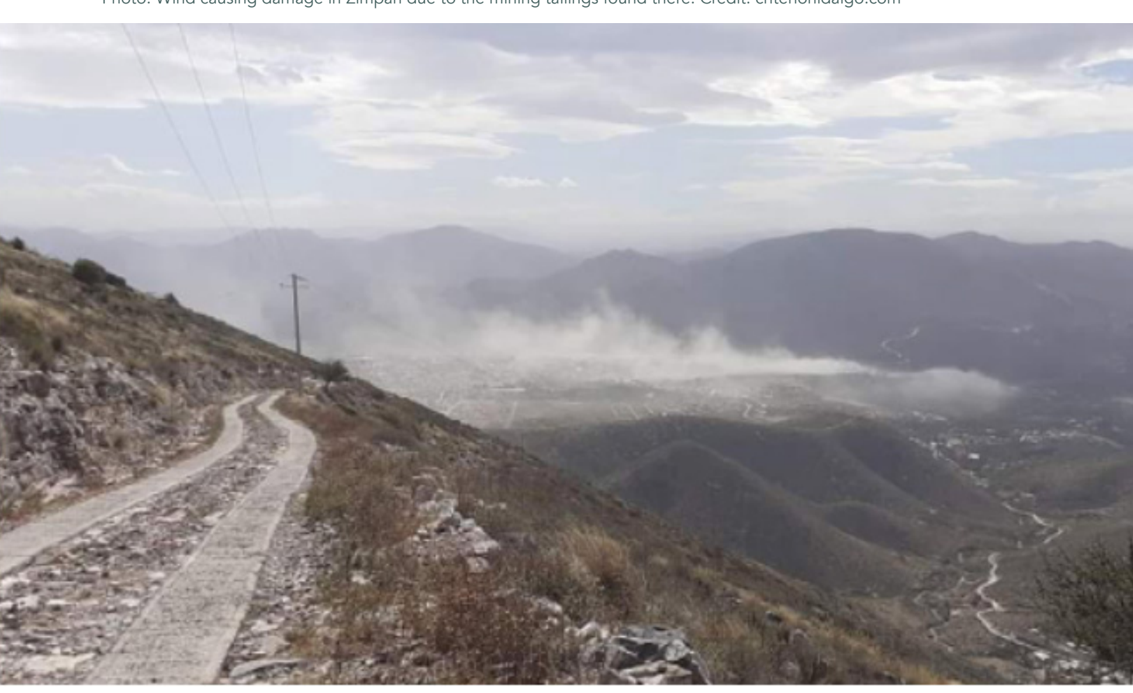
Photo: Wind causing damage in Zimpán due to the mining tailings found there.