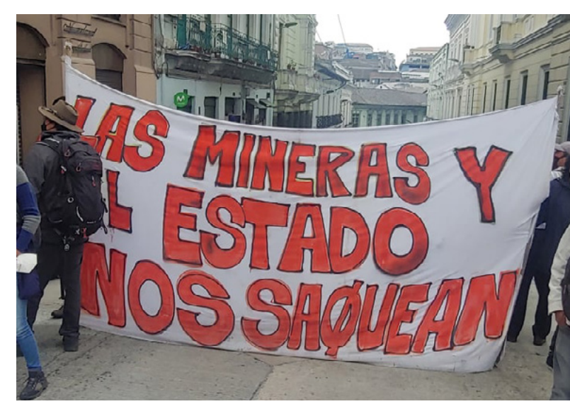
Photo: Protest in Quito against Mining Decree 151, October 2021.

It was not only the people who arrived, but also a couple of military trucks turned up and passed through the crowd, they intervened in our protest and one soldier gets out. He approaches the stage, takes out his gun, leaves it on top of one of the speakers that