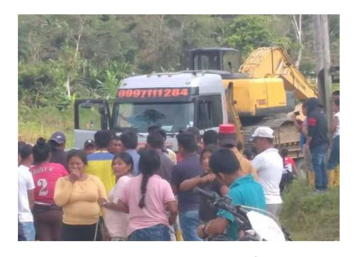
Photo: An attempt by Solaris Resources to forcibly bring in machinery to the community of Maikiuants, in August 2021.

In contrast no measures have been taken to lower the levels of subjugation, extortion, forced displacement and violence against the communities that inhabit these same areas - such as the community of El Bajío, which neighbours the La Herradura mine, where the Penmont company from the same business group operated illegally until 2013. In addition, between 2020 and 2021 there were significant cuts in the budget of government entities responsible for environmental protection (De La Rosa, 2021); two environmental bodies were eliminated altogether (Laureles, 2021), and a State trust fund with resources for the protection of human rights and environmental defenders was removed (Artículo 19, 2020).