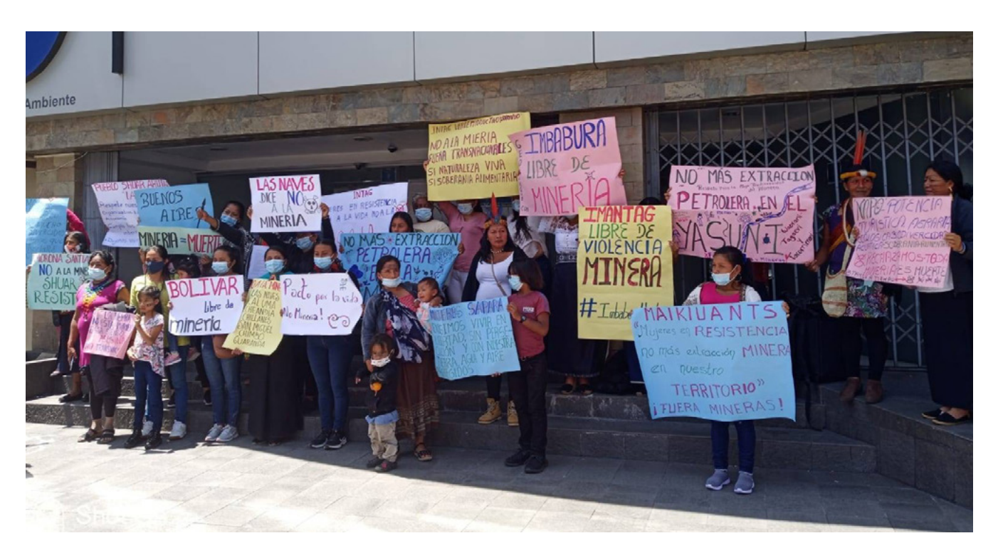
Photo: Demonstration in front of the Ministry of the Environment. October 2021.