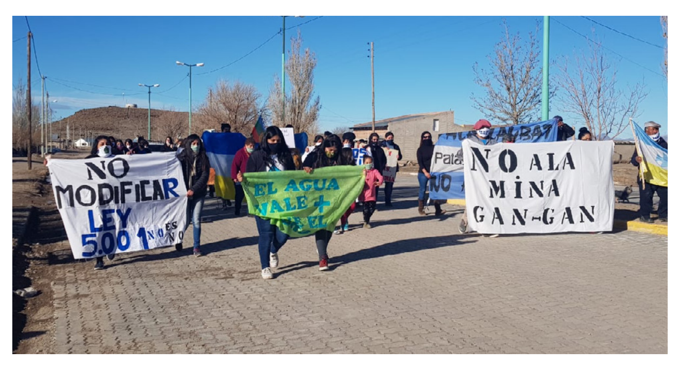
Photo: March in the Mapuche Tehuelche community of Gan Gan in the meseta (plateau) of Chubut, on August 4, 2020.