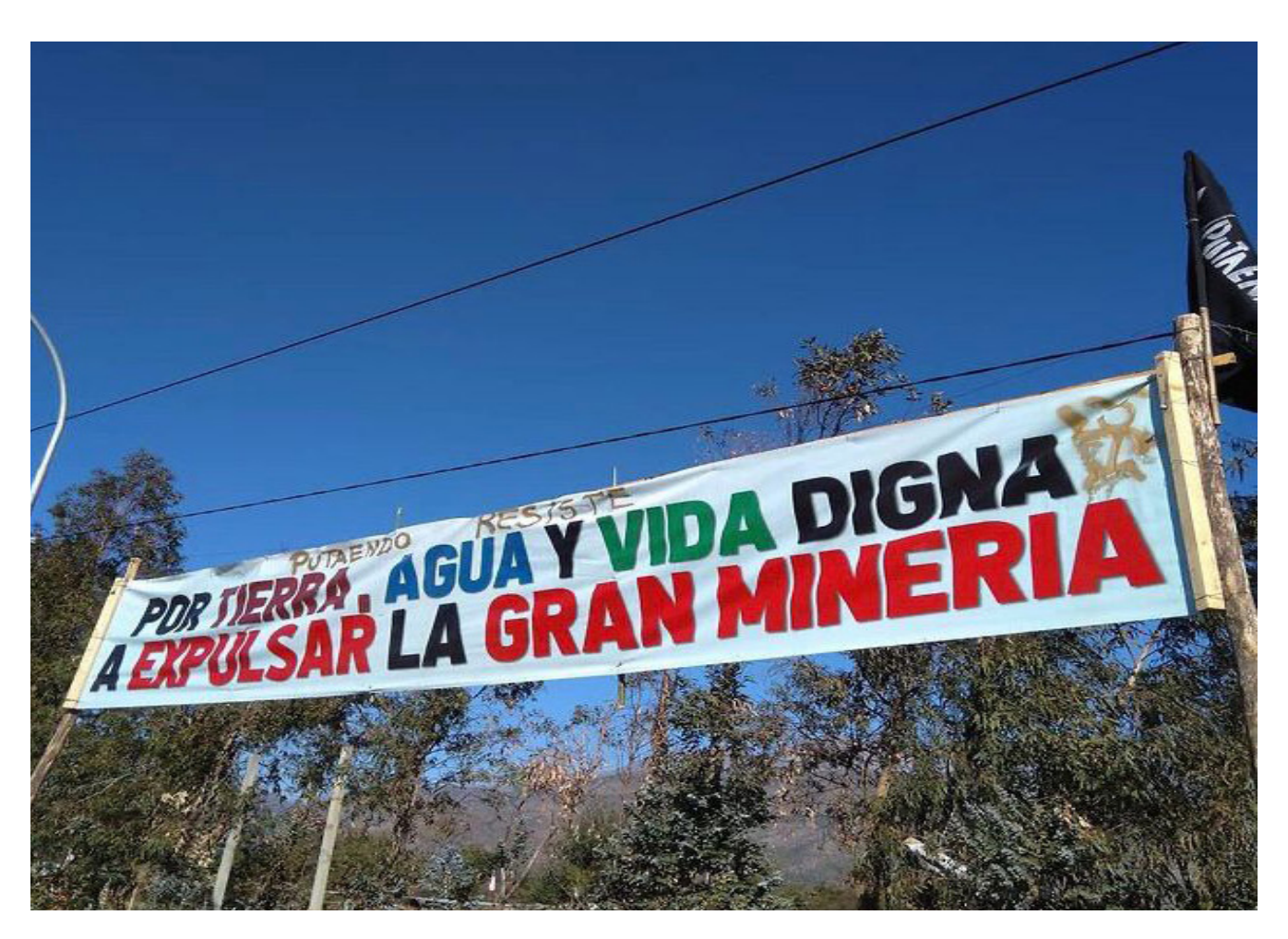
Photo: One of the many anti-mining signs around the community of Putaendo in Chile.

the sanitary equipment... [is] already quite cheap... [these donations were] only for photo opportunities, in truth they only have one photo with a group of traders who agreed to take photos with them. [The company] is trying to take advantage of the needs and hardship of the people in its favor and to appear to be very well connected with the local people... and that they are good neighbors.