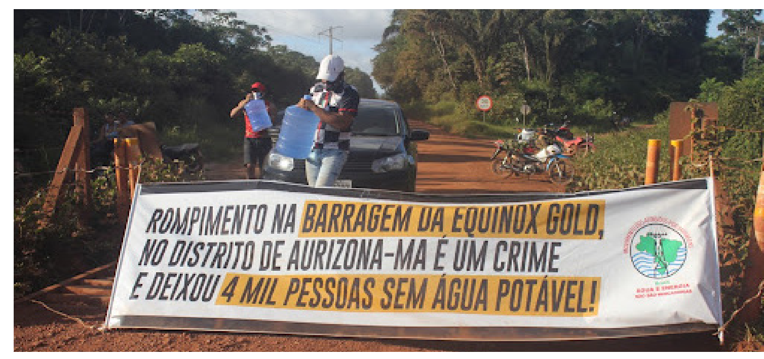
Photo: Banner in a protest in Aurizona, Maranhão, Brazil: "The rupture of Equinox Gold's dam in Aurizona is a crime that left 4,000 people without access to water."