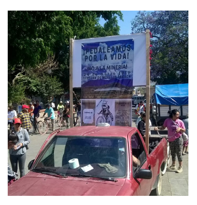
Photo: A bicycle protest against mining.

[...] there you have it, one of the great strengths that our movement has had is that we are working a priori, before the damage is done, before people start getting sick.<sup>62</sup>