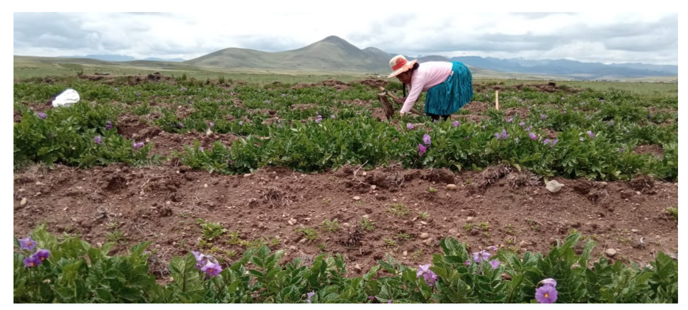
Photo: Women members of the Asociación de Mujeres defensoras del Territorio y la Cultura K´ana harvesting potatoes in Espinar.