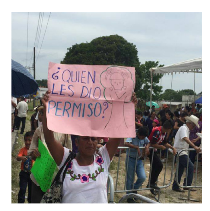
Photo: Visit from the governor of Chiapas to Acacoyagua, Chipas in 2017. The FPDS was called to carry out a dialogue.

During the pandemic mining activity was spotted in Acacoyagua in April 2020, coinciding with a national strategy announcement that declared mining a "non-essential" activity. With the help of the Chiapas government, the companies convened the communities under the pretext of "resuming dialogue". They summoned sixteen community leaders whom the companies had criminalized and delegitimized in 2017. At a time when schools were suspended and communities had forbidden entry to outsiders, in order to protect themselves from the pandemic, the state authorities persisted in convincing the inhabitants to establish communication with the companies.