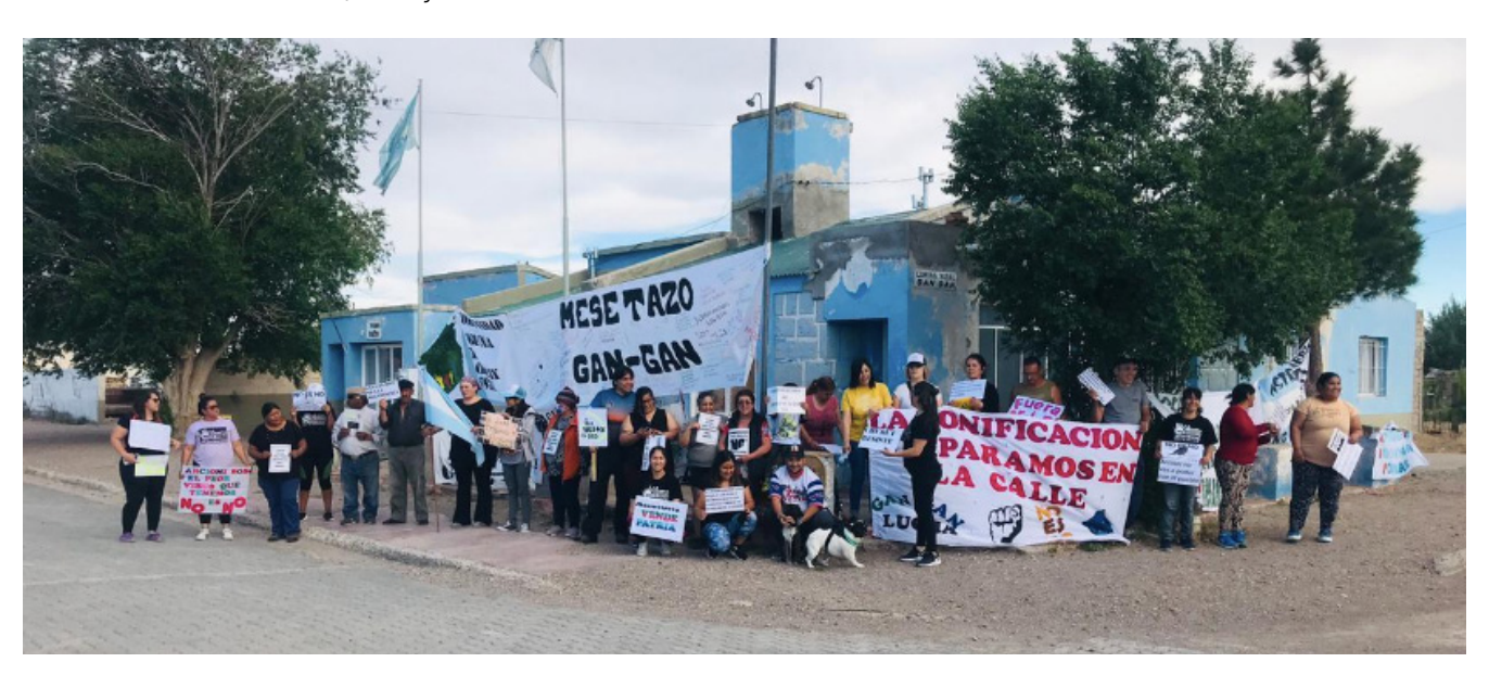
Photo: A protest led by the Mapuche Tehuelche community of Laguna Fría-Chacay Oeste against the temporary approval of a law to re-zone the province to allow for mining. December 2021. Credit: Ivan Paillalaf

61 Personal communication, 22 July 2021.